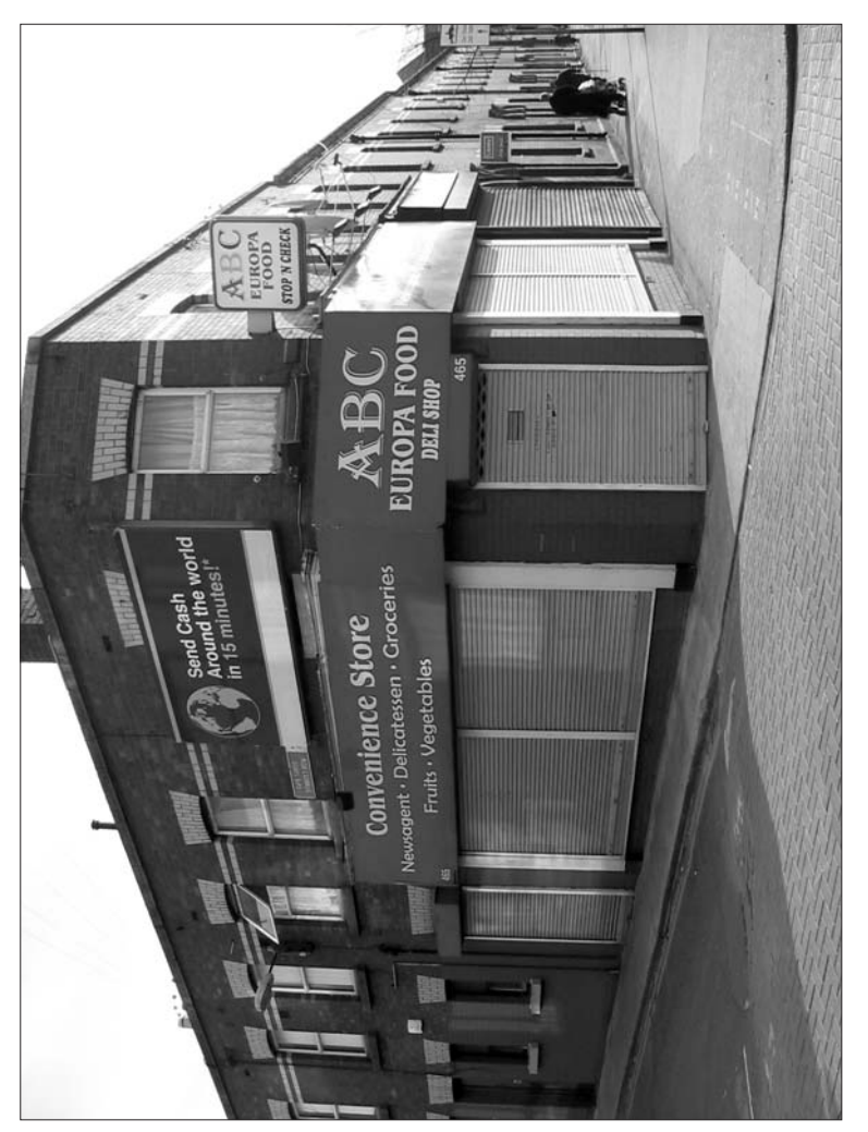
Romanian shop in Dublin selling "European" food