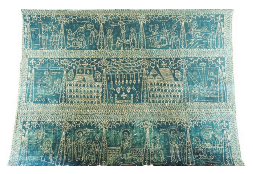
Picture 1. Altar curtain from the Holy Cross Armenian Church in Suceava, 1787, Tokat (Evdokia), Armenian Museum in Bucharest, Romania