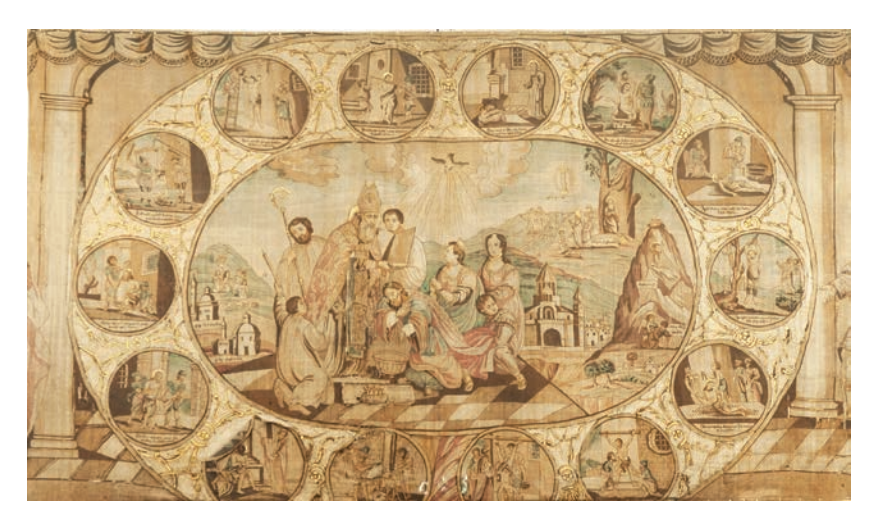
Picture 5. Altar curtain from the Holy Virgin Armenian Church in Galati, second half of the 18<sup>th</sup> century-first half of the 19<sup>th</sup> century, Constantinople, Armenian Museum in Bucharest, Romania