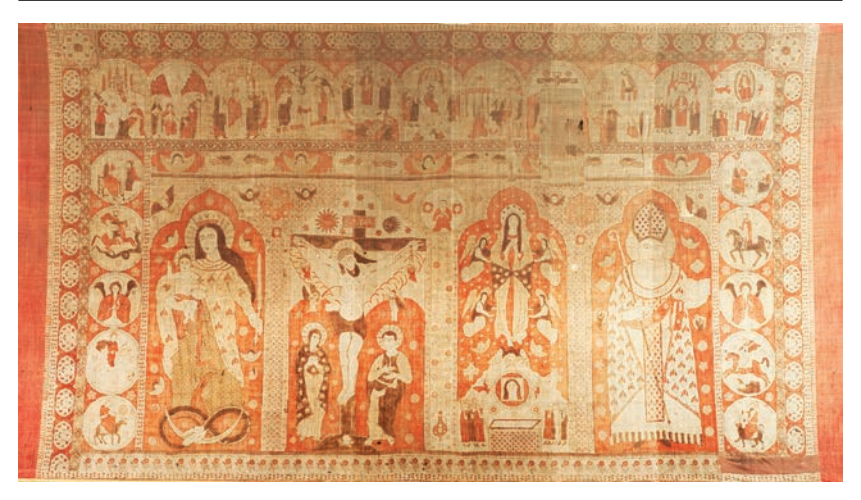
Picture 3. Altar curtain from the Holy Virgin Armenian Church in Botosani, 1763, Tokat (Evdokia), Armenian Museum in Bucharest, Romania