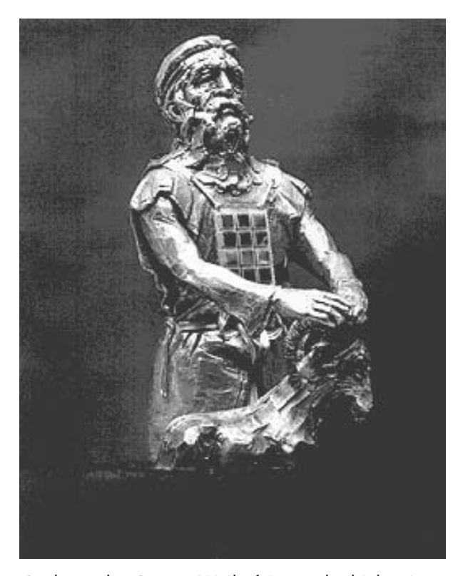
Sculpture by George Weil of Aaron the high priest, wearing the priestly vestments and the Urim and Thummim oracle.

The translucent stone nevertheless implies a specific color (the transparency is not perfect). But light can be grasped beyond that transparent color. This explains the many veils mentioned by the doctors of the Talmud (and quoted by Maimonides) when referring to the common prophets. From a strictly physical point of view, many veils, even if transparent, become translucent or opaque if their number is great. Moses saw God through one transparent veil ("ba-aspeklaria ha-meira"). The materiality of the imagination is non-existent: there is no color, no specific nuance. The veil is that of the intellect of the intellect is invisible/transparent.