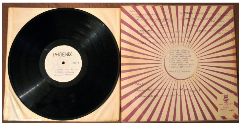
Phoenix, Cei ce ne-au dat nume (1980s Bootleg Copy) (Author's Personal Collection)