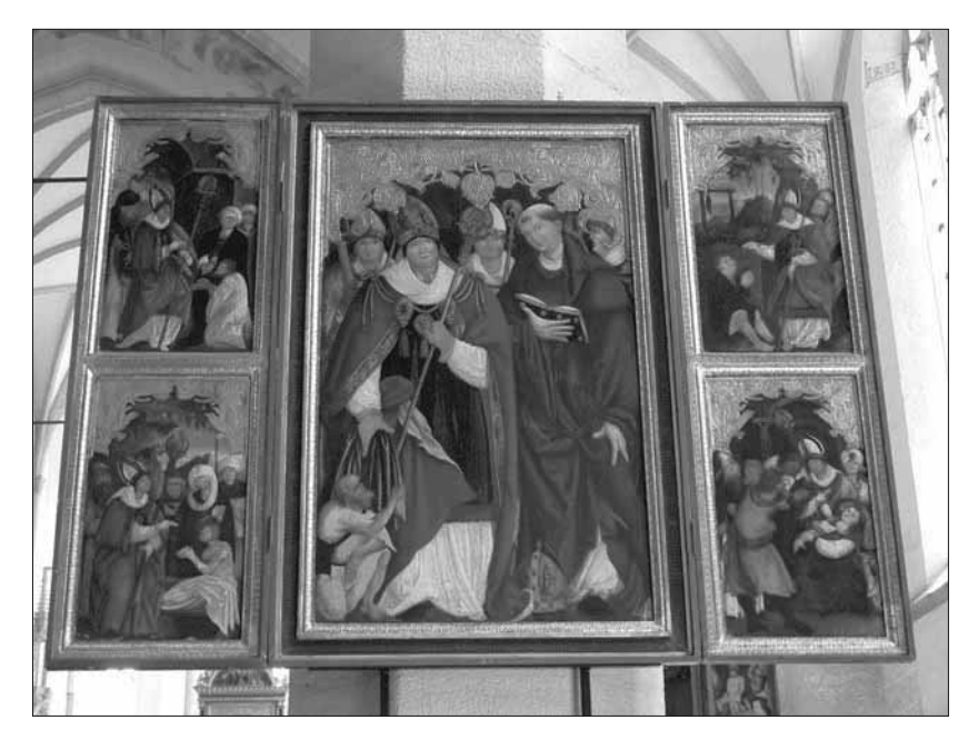
The altarpiece from the Dominican church of Sigișoara/Schässburg (open)