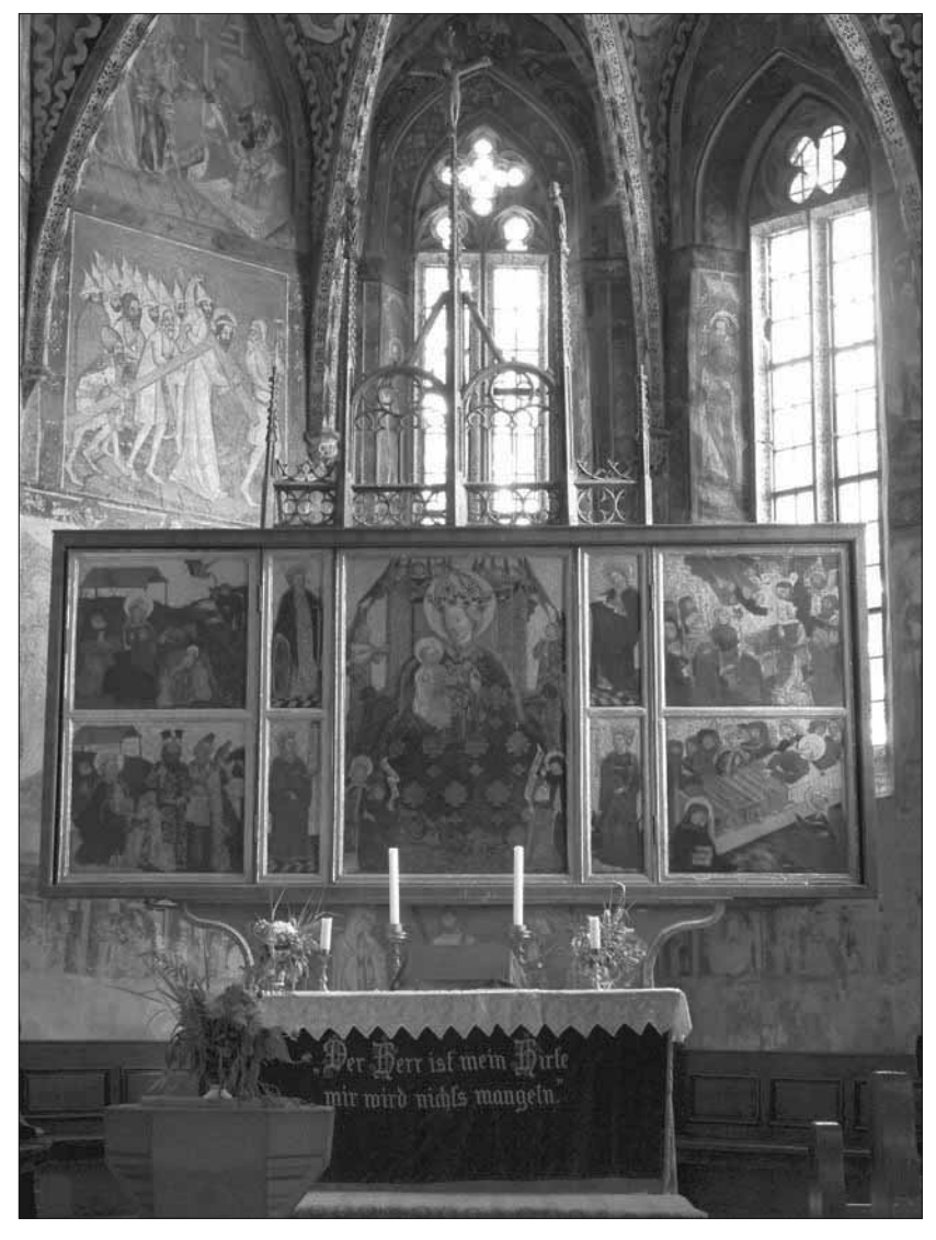
The altarpiece from Mălâncrav/Malmkrog (preserved in situ)