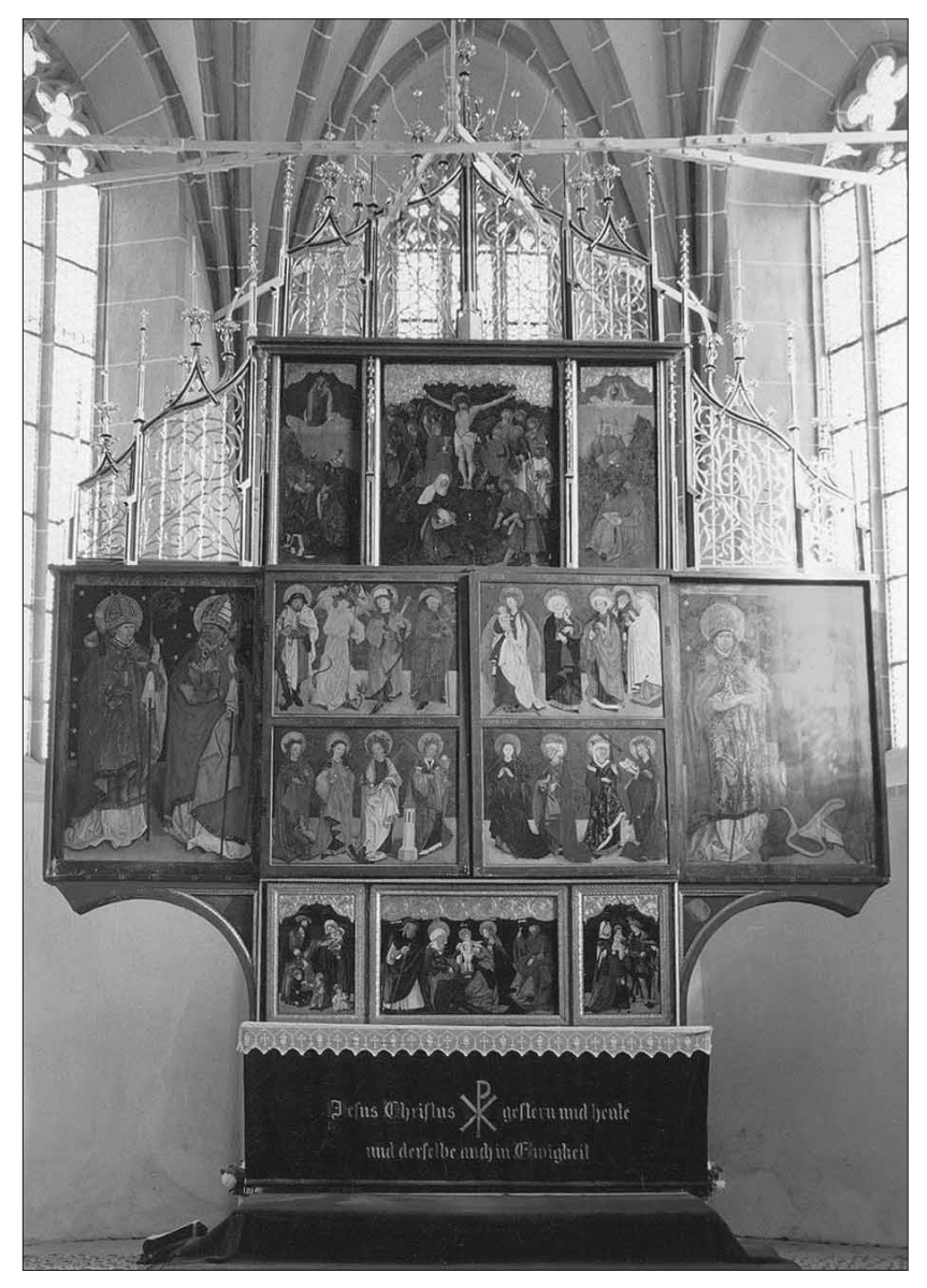
The altarpiece from Biertan/Birthälm (Werktagsseite)