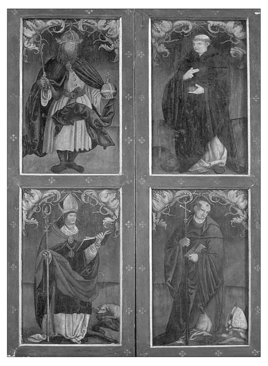
The altarpiece from the Dominican church of Sigișoara/Schässburg (closed)