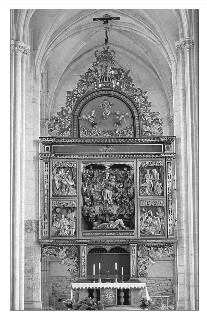
The altarpiece from Sebeş/Mühlbach (preserved in situ)